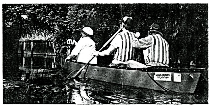
MEMBERS EVENTS SEE PAGE 7